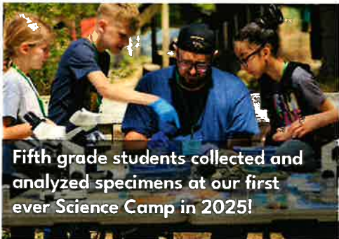
Fifth grade students collected and analyzed specimens at our first ever Science Camp in 2025!