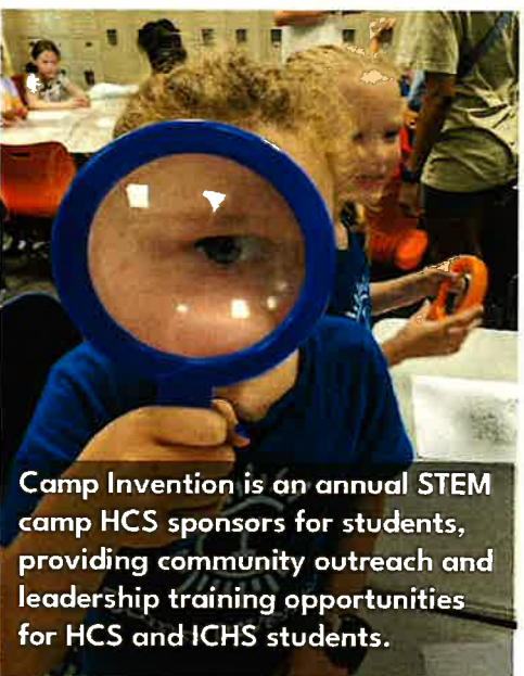
Camp Invention is an annual STEM camp HCS sponsors for students, providing community outreach and leadership training opportunities for HCS and ICBS students.