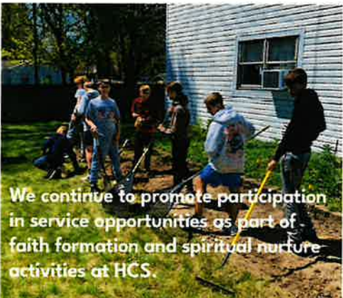
We continue to promote participation in service opportunities as part of faith formation and spiritual nurture activities at HCS.