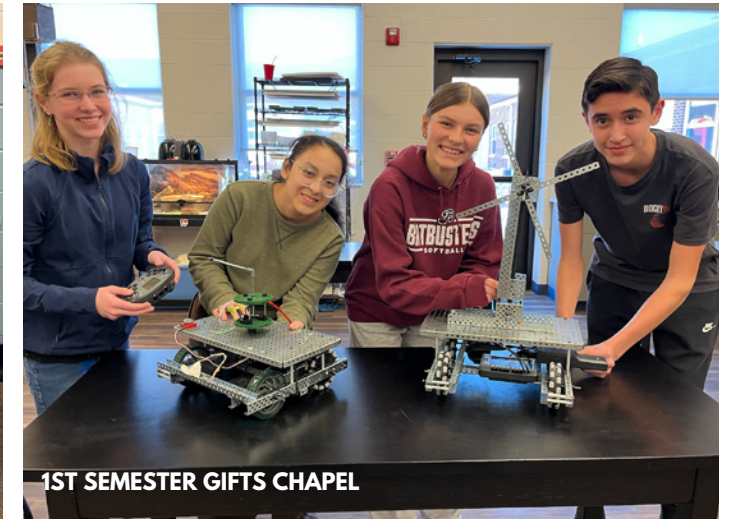
1ST SEMESTER GIFTS CHAPEL