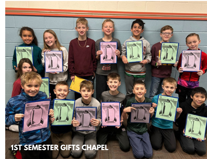
1ST SEMESTER GIFTS CHAPEL

Since 2021, students have grown an average of 151% in mathematics and 107% in reading on normed formative assessments.