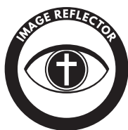
IMAGE REFLECTOR who individually and uniquely reflects God's image. Display God's power and glory, and recognize His image in all whom we encounter.

The LORD God took the man and put him in the Garden of Eden to work it and take care of it. Genesis 2:15