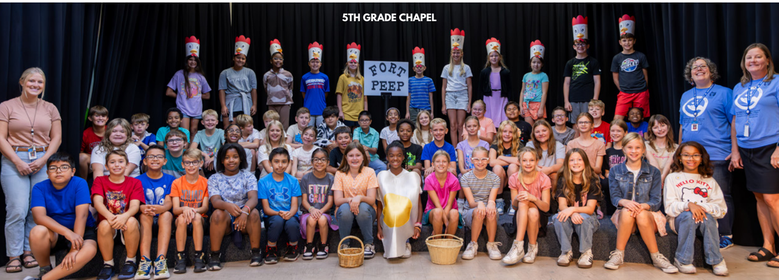
5TH GRADE CHAPEL

"TRAIN UP A CHILD IN THE WAY HE SHOULD GO AND WHEN HE IS OLD, HE WILL NOT DEPART FROM IT." PROVERBS 22:6