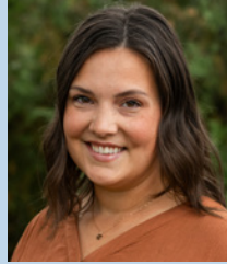
Faith Best Before & After Care