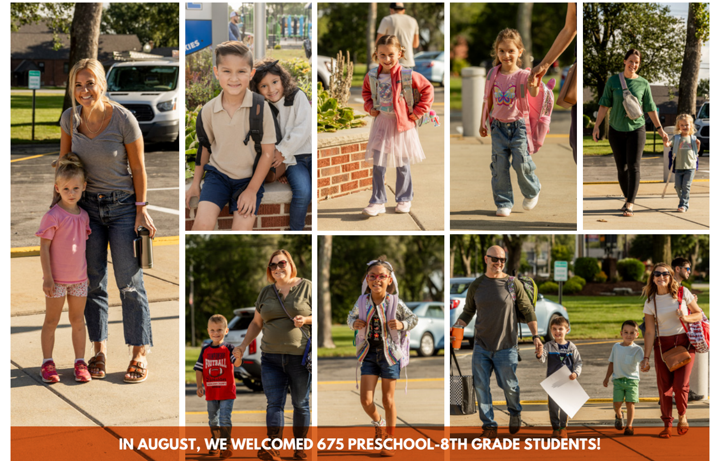
IN AUGUST, WE WELCOMED 675 PRESCHOOL-8TH GRADE STUDENTS!