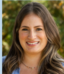
Destiny Garza Discovery Center