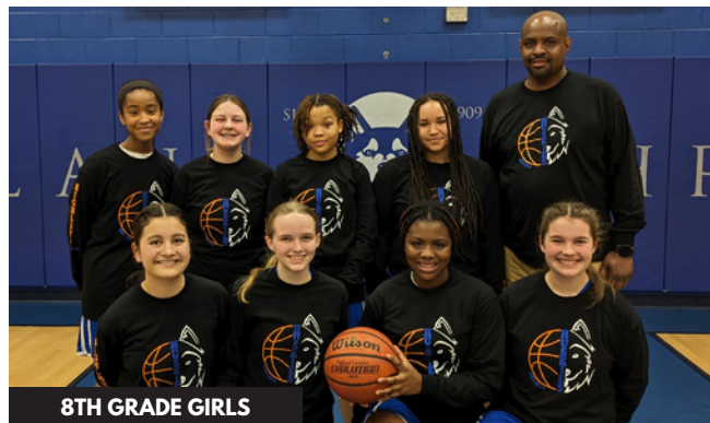
8TH GRADE GIRLS