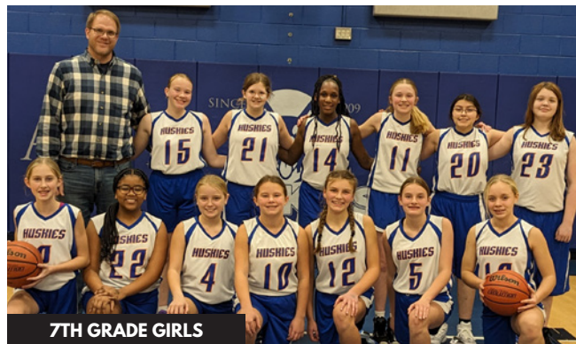
7TH GRADE GIRLS