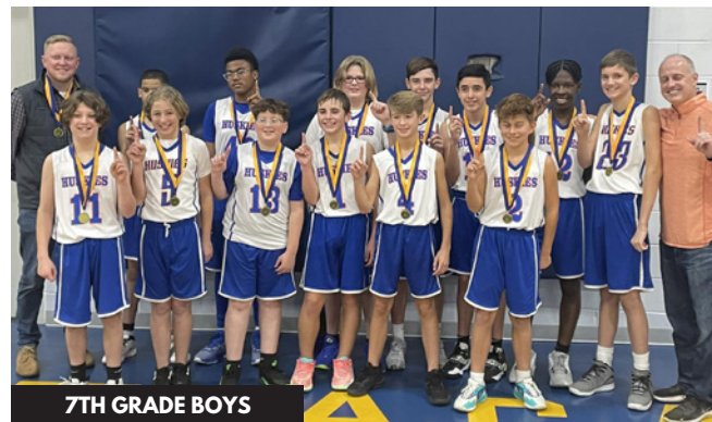
7TH GRADE BOYS