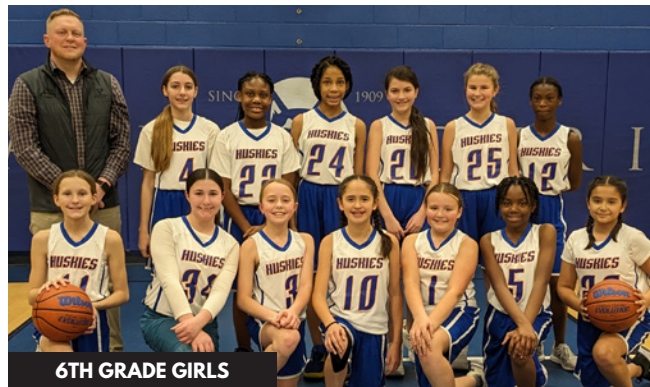
6TH GRADE GIRLS