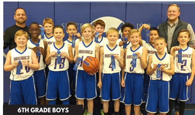
6TH GRADE BOYS