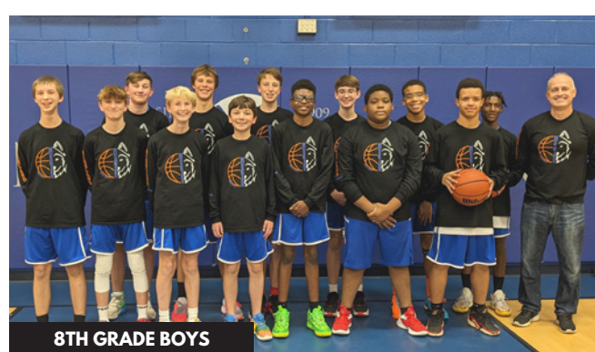
8TH GRADE BOYS